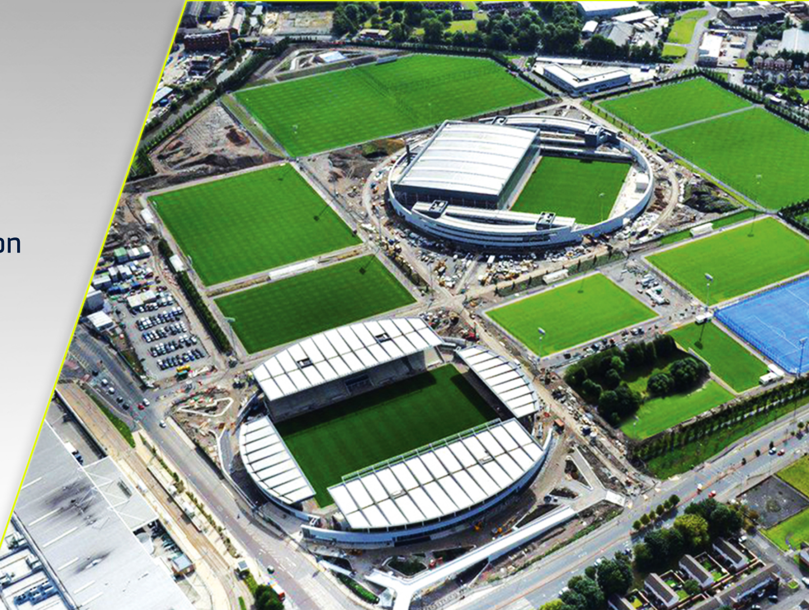
City Football Academy official facilities

Then travel to St. George's Park, the home of the England National team, and train with The Football Association coaches. Finish your journey in the capital, London, and truly experience how the passion for soccer runs through the city!