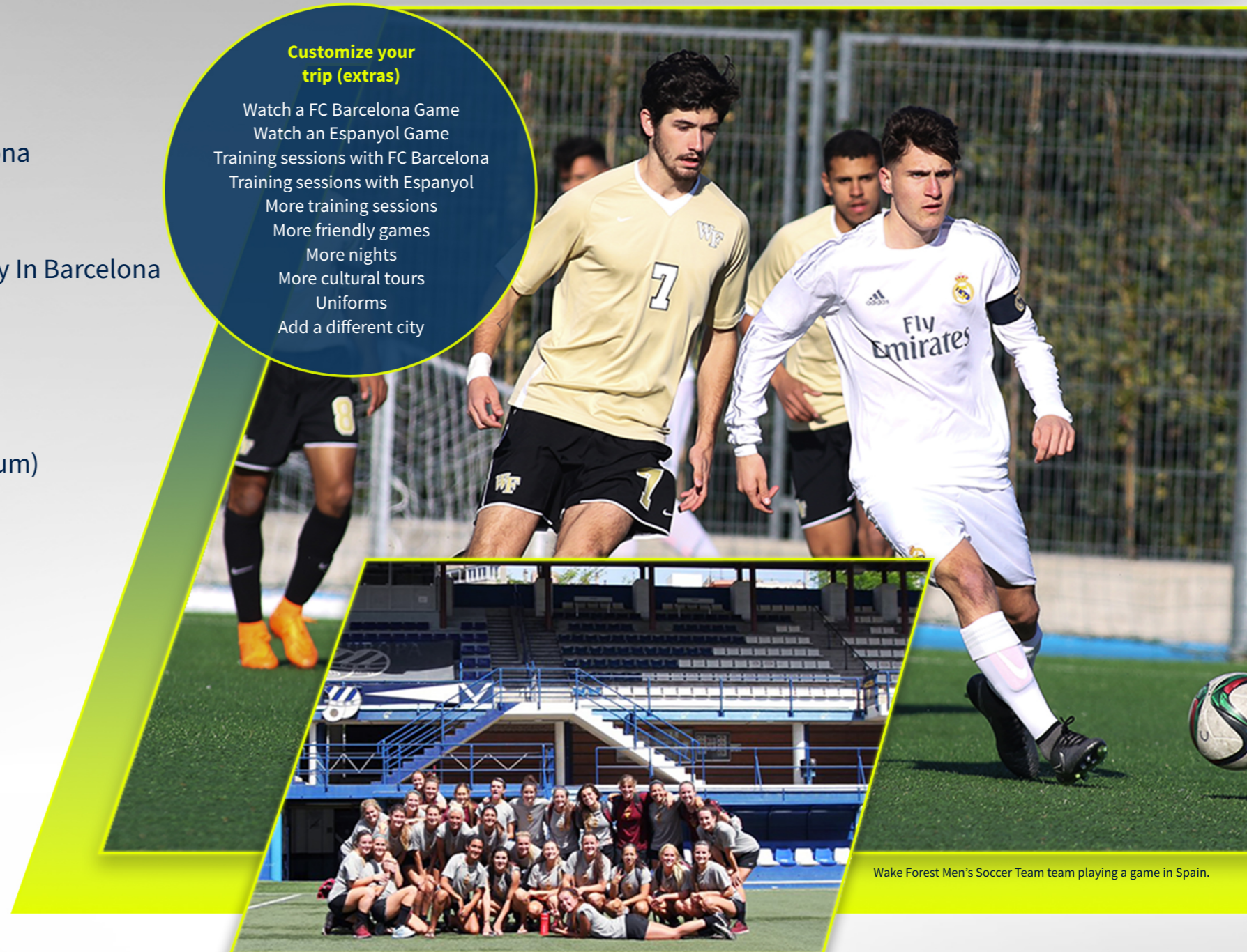
Wake Forest Men's Soccer Team team playing a game in Spain.